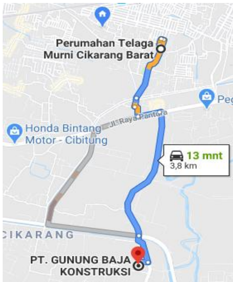
Figure 1. Research location

The research location is presented in Figure 1.